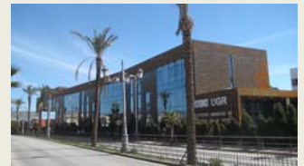
CSIC-IACT New Institute